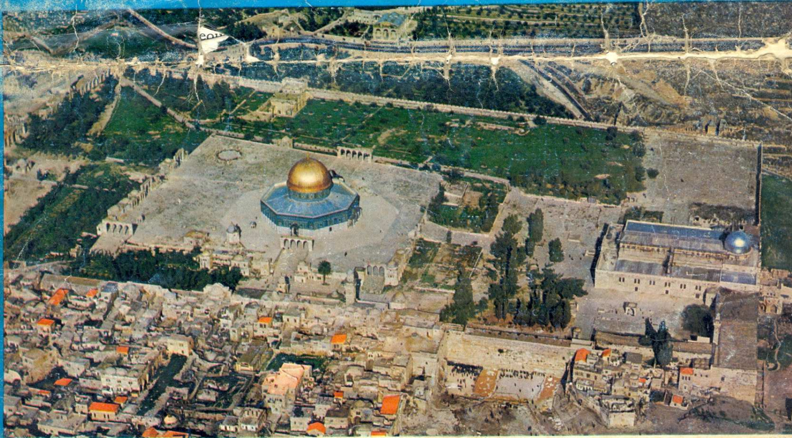
Jerusalem. The Old City from the air. From here He commanded blessings, even life forevermore. He hath chosen ZION. He hath desired it for His habitation. "Here will I dwell". — Psalms 132: 13, 14, and 133: 3.

Looking East, showing Mohammedan Mosque where Solomon's Temple stood. Note Eastern Wall, on the side of the Valley of Jehoshaphat.